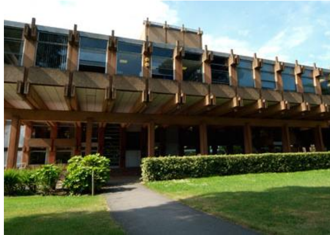
Figure 1. The surveyed building.

The surveyed building is located in Whiteknight campus, University of Reading, UK. It is designed as non-air-conditioned with heating supplied in winter. Figure 1 shows the north façade of the building. This building has four floors with north-south orientation and flat roof. The structure is brick-concrete. The windows are single-glazed with aluminium alloy frames. It was usually occupied by lecturers, administrative staff, academic researchers and students.