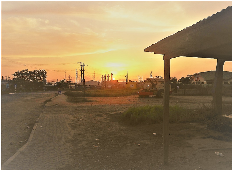
Figure 3: Entry road into Takoradi, with the power station in the background.

TTPS was the first of Ghana's thermal power stations, commencing operation in 1997 (Figure 3). Despite its name, the power station is in fact located in Aboadze, a small fishing community approximately 15km north-east of Takoradi. As a thermal power station, TTPS operates through the burning of fossil-fuels (natural gas or light crude oil) in order to heat water, creating steam which rotates a turbine, generating electricity. Ghana does not have the capacity to refine oil from its own Jubilee Fields, so is currently entirely dependent on imports (Sakah et al. 2017). Oil is stored on-site in large tanks, fed by tankers that connect to a single-mooring point approximately 4km offshore. For some time, the country was similarly reliant on gas imports, powering its station with gas from the West African Gas Pipeline (WAGP), however it has recently been able to obtain gas from its domestic sources.