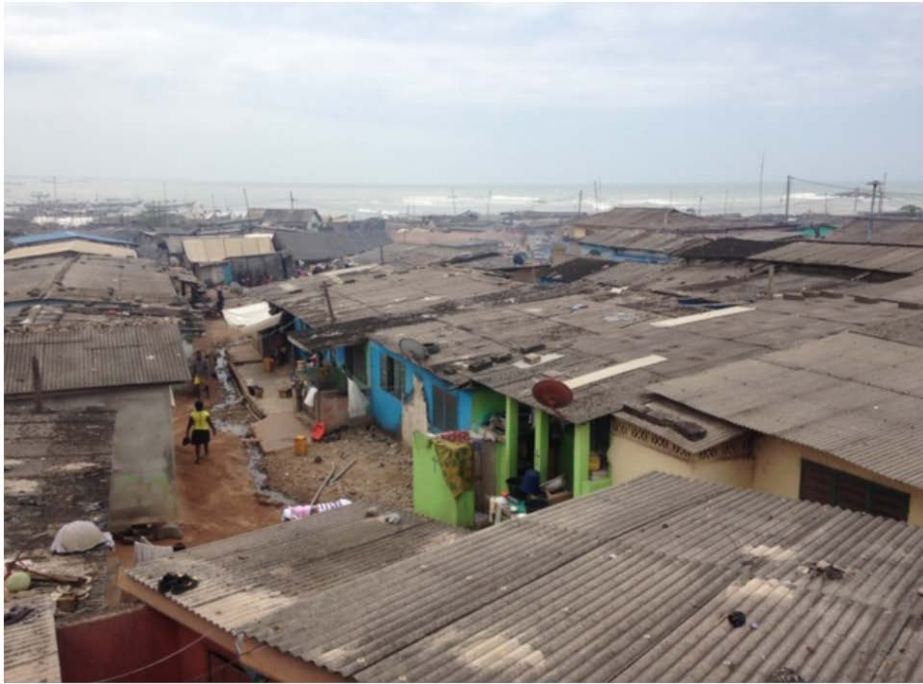
Figure 4: Densely populated housing area near the seafront in Aboadze.

Taking violence as an act that increases vulnerability, we can see that these land and ocean grabs have undeniably inflicted violence upon community members, depriving them of appropriate compensation, taking land and drawing an influx of people that drive up rent prices thereby exacerbating the poverty already harshly experienced by SSMF communities. They also reinforce existing social inequalities, inevitably impacting those who are poorest in the community the hardest. This is exemplified by those who operate small canoes, who are now unable to fish in the local vicinity.