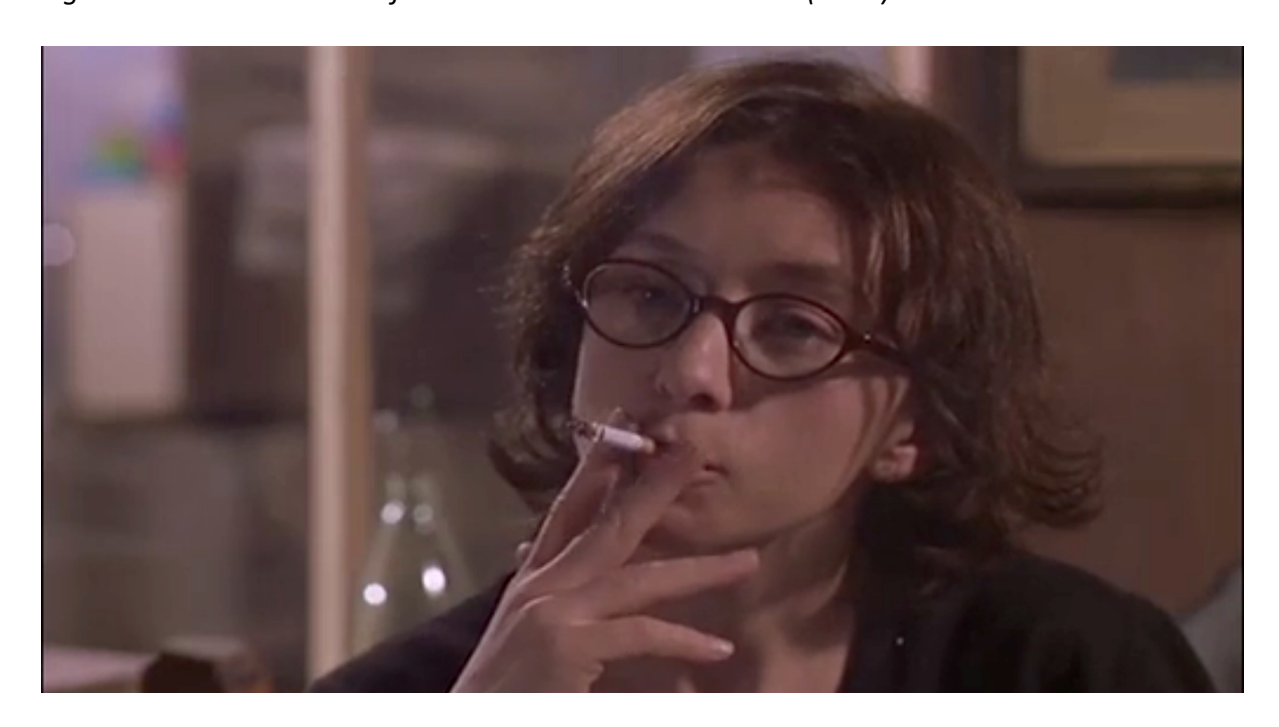
Figure 2: Sylvie Testud's face in Demain on déménage (2004)