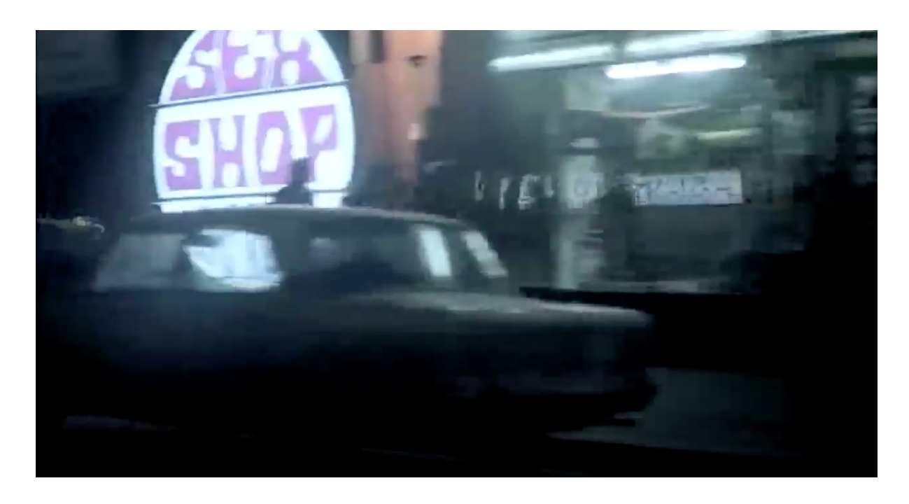
Figure 6: Sex Shops in Pigalle, Les Rendez-vous d'Anna

What I see in Anna's young, unlined face is quiet, absorbed misery. I search for the signs of sadness in her face, for the prick of tears in her shining eyes, the slight adjustment of her jaw and opened mouth as if to exhale pain, just as I search for identifying landmarks in the city that are implicitly the objects of Anna's looking. The matching dashboard shot that follows the extended, silent portrait of Anna, reveals a dehumanized, barely illuminated Paris, populated by the rear lights and bumpers of endless streams of cars. Almost nothing of human shape or size is observable within the frame: vehicles and buildings, street lamps and street furniture dance before the screen and emanate light in a human darkness, reflected occasionally in an otherwise invisibly present windscreen. Both the camera, and the implied vision of Anna, demonstrate a desolate absorption in the movement through the city of Paris, where the church of the Madeleine (Fig. 5) and the sex shops of Pigalle (Fig. 6) intermingle with car headlamps and wet streets. She looks, she listens, she waits, as she travels. But as she looks outwards, beyond the frame, she is also looking inwards; her