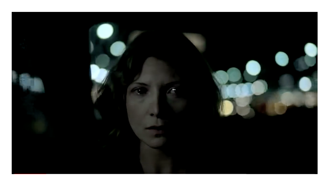
Figure 4: Aurore Clément in Paris, Les Rendez-vous d'Anna