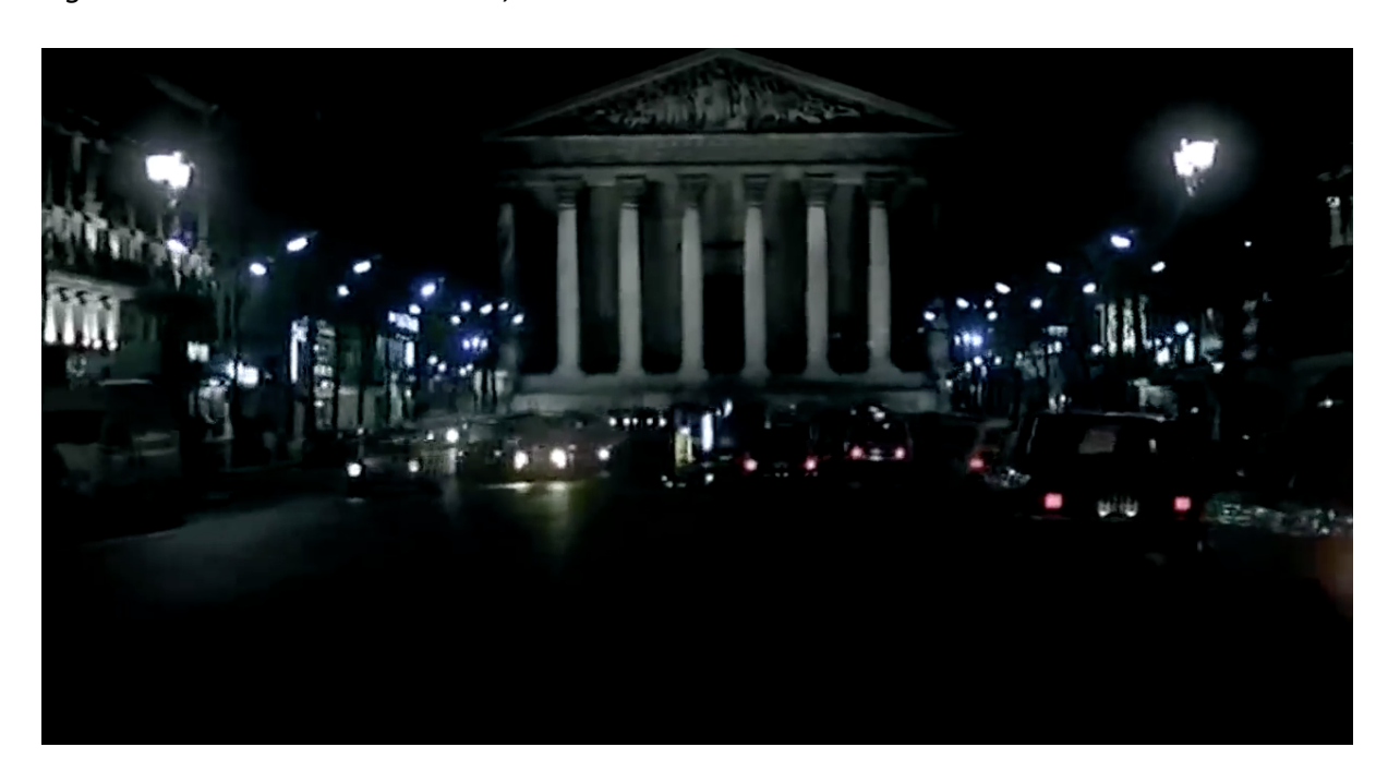
Figure 5: Church of the Madeleine in Les Rendez-vous d'Anna