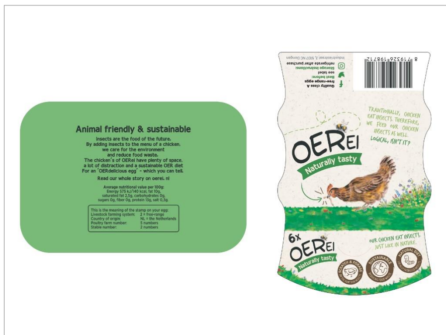
Figure 2. Packaging provided to participants during Section 4 of the focus groups.

taste (4 cases). The feeling of disgust and the rejection of insects seemed to slightly moderate consumers' intentions. However, only one participant revealed that the negative feeling for insects reduced their level of acceptance (Table 4).