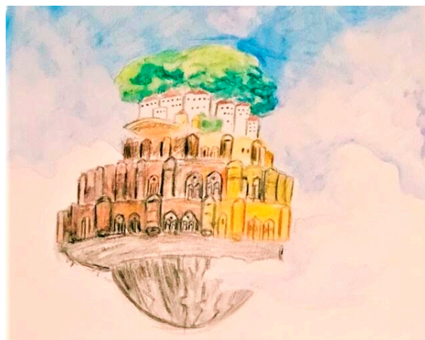
Figure 3. Laputa the floating city shrouded by clouds in the sky, as depicted in Laputa: Castle in the Sky (1986).

Miyazaki frequently portrayed human greed and over-consumption as the true villains. This is clearly illustrated by Laputa: Castle in the Sky (1986) and by Spirited Away (2001). Laputa is described as a once magnificent city with technology surpassing modern times; however, human greed resulted in its destruction. We see Laputa for the first time as clouds shrouding the floating city break apart and reveal an island-like castle (Figure 3). It has been hundreds of years since humans have set foot on Laputa, and the city is now void of human life. The only reminders of human technology are the ancient castle structures and giant humanoid robots that remain.