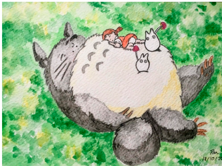
Figure 4. Totoro, a giant forest spirit, with Mei and smaller Totoros lying on top of him, as depicted in My Neighbor Totoro (1988).

Although the film is targeted at younger viewers, it deals with a serious emotional issue. How do children cope mentally when a parent develops a serious illness? At the start, we learn that the two sisters are moving to the countryside because their mother is recovering in a nearby hospital. A mother is a critical nurturing figure, and her absence can cause anxiety in children. In some ways, Totoro acts as the motherly figure in the film. Totoro is a gigantic and furry forest spirit, resembling a mixture of a cat, an owl and the Japanese raccoon dog (Figure 4). Totoro is deliberately depicted as a warm and fuzzy entity, always appearing to the sisters at their times of need. As adult viewers, we wonder whether Totoro is a figment of the girls' imagination, made up to deal with the stress of moving to a new house and their sick mother. Regardless of whether Totoro is real or not, however, we are shown the healing effects of nature both physically and mentally.