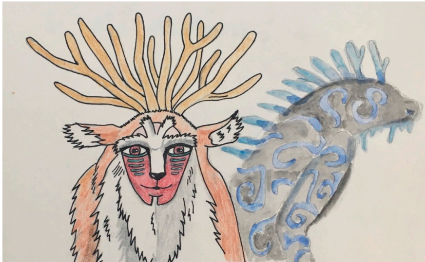
Figure 5. The Forest Spirit (Shishigami) and the Night Walker, which the forest spirit transforms into at night, as depicted in Princess Mononoke (1997).

In Princess Mononoke (1997), humans and Kamis fight over forest resources. The most powerful kami is the Forest Spirit (i.e., the Shishigami), who is neither good nor evil but a personification of the forest (Figure 5). In the daytime, the Forest Spirit presents as a deer with a human face. At nighttime, it transforms into a giant and translucent humanoid (i.e., the Night Walker). The Night Walker is eerie and unnerving to look at, almost resembling a monstrosity.