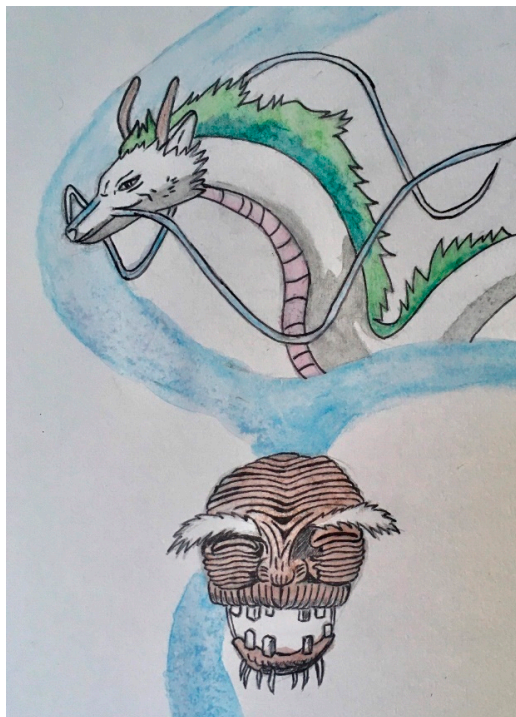
Figure 6. Haku, a young river spirit, and the ancient river spirit that was first mistaken as a Stink Spirit, as depicted in Spirited Away (2001).

In Spirited Away (2001), the female protagonist Chihiro is trapped in the world of Kamis. Both animism and identity are important themes in the film. Haku, the male protagonist, cannot return home because he has forgotten his name. Viewers learn that Haku is a river spirit that can take the form of a white dragon (Figure 6). His river was destroyed to build apartment complexes, so he has no home. Haku's character is inspired by the Japanese dragon, a serpent-like creature that has power over water bodies. When we see Haku's true form as a white dragon, majestic and flowing like a river, we are left in awe. This reminds us that humans have destroyed an entire ecosystem for a short-term benefit, and we have forgotten what is truly valuable.