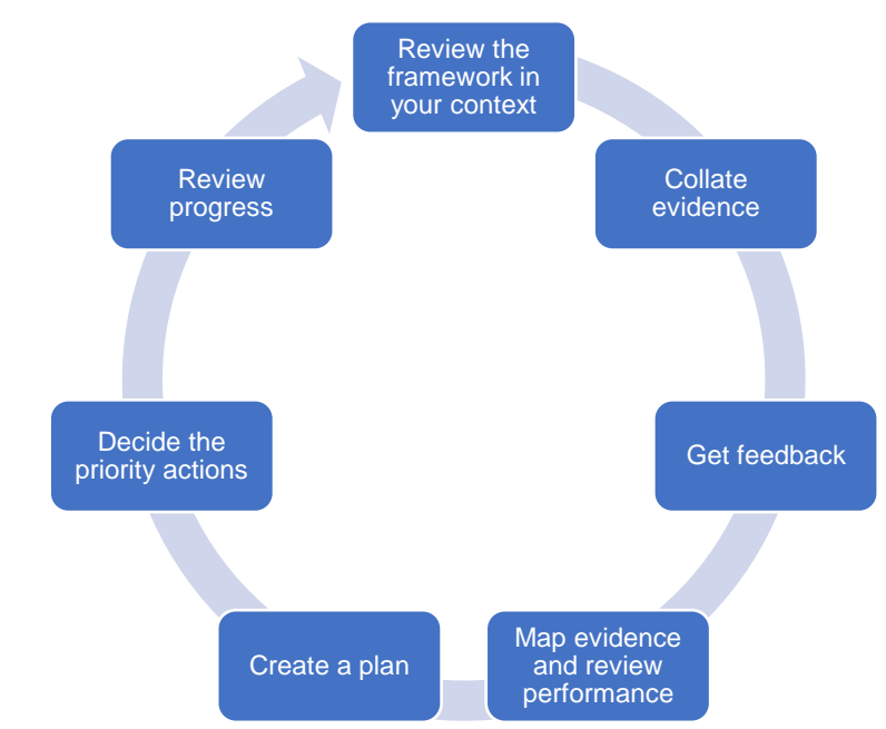
Figure 3 - Example process to reflect on the framework