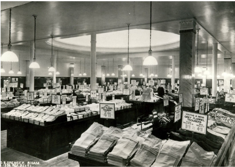
Figure 1. Open display at the M&S Birmingham store, January 1933.